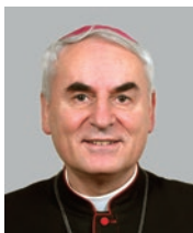
Diocesan Bishop Msgr. Vojtěch Cikrle 13th Bishop of Brno (1990)