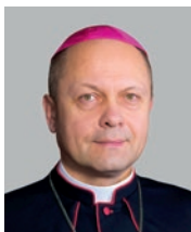
Auxiliary Bishop Msgr. Zdenek Wasserbaeur (2018)