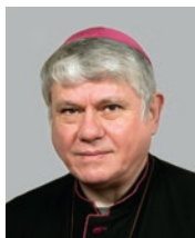
Auxiliary Bishop Msgr. Václav Malý (1997)