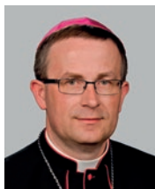
Apostolic administrator sede plena et ad nutum Sanctae Sedis