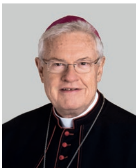
Apostolic Nuncio in the Czech Republic H.E. Msgr. Charles D. Balvo

The apostolic nunciature is a diplomatic mission of the Holy See in individual countries.