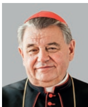
Archbishop Cardinal Dominik Duka, OP 36th Archbishop of Prague (2010)